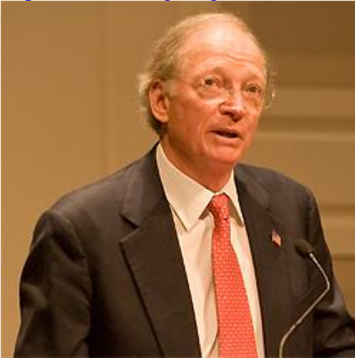
Hoover Institution: http://www.hoover.org/about http://en.wikipedia.org/wiki/Hoover_Institution