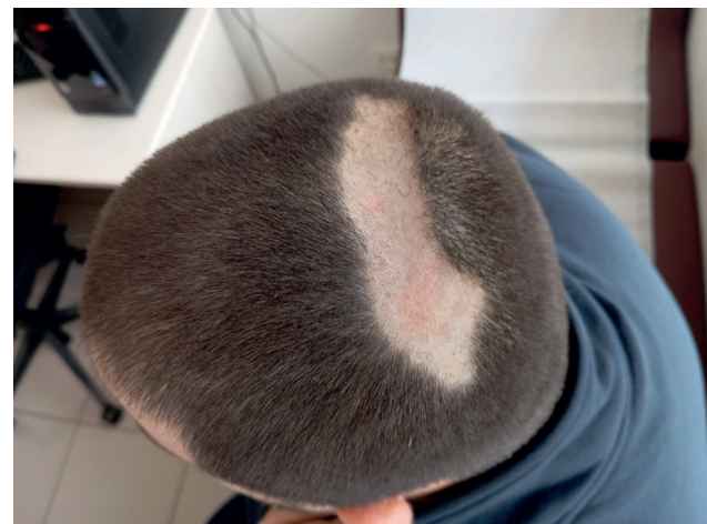
Figure 2. Alopecia following total thyroidectomy and lymph node dissection